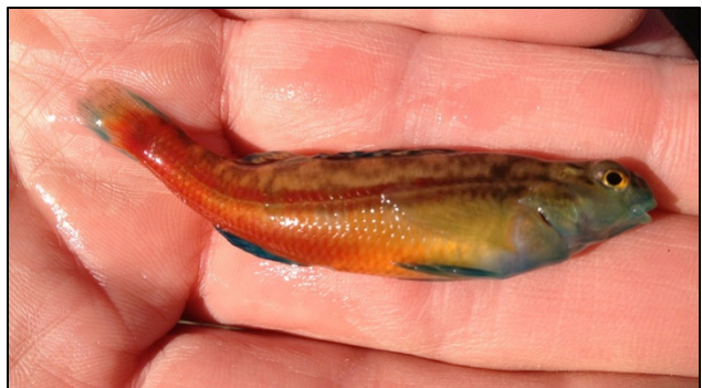
Michael holding a male darter. The bright color patterns differ for each of the over 200 species.