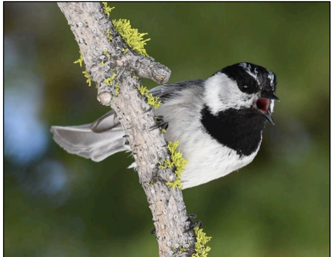
Mountain chickadee, photo by Vladimir Pravosudov

Depending on where they live, animals can face a variety of challenges from the environment. For example, animal species that live in cold environments may have adaptive traits that help them survive and reproduce under those conditions, such as thick fur or a layer of blubber. Animals may also have adaptive behaviors that help them deal with the environment, such as storing food for periods when it is scarce or hibernating during times of the year when living conditions are most unfavorable. These adaptations are usually consistently seen in all individuals within a species. However, sometimes populations of the same species may be exposed to different conditions depending on where they live. The idea that populations of the same species have evolved as a result of certain aspects of their environment is called local adaptation .