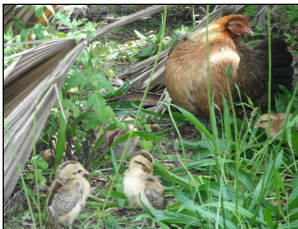
Feral hen on Kauai with her recently hatched chicks.