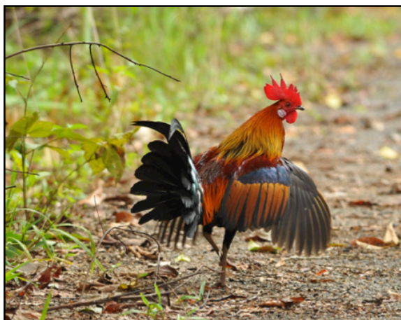
Red Junglefowl are the same species as chickens ( Gallus gallus ). On Kauai, they mated with feral chickens to produce hybrids.