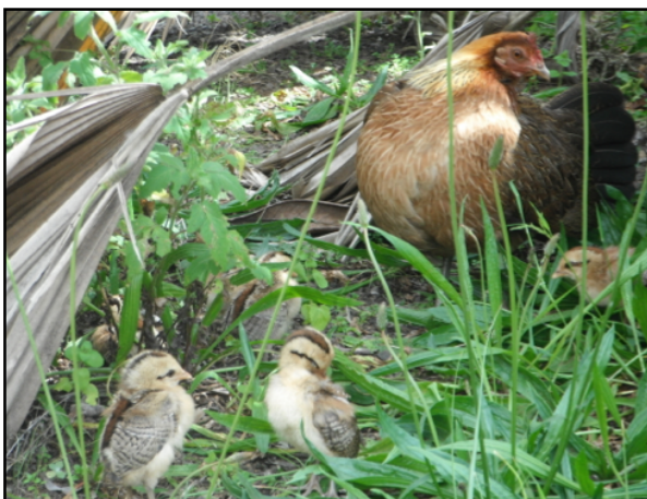
Feral hen on Kauai with her recently hatched chicks.