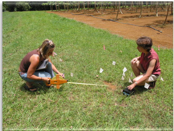
Robin (left) with her advisor (right), counting the number of crickets that entered a circle while the song was playing.

Without their song, how are flatwing crickets able to attract females? In some other animal species, like birds, males use an alternative to singing, called satellite behavior . Satellite males hang out near a singing male and attempt to mate with females who have been attracted by the song. This helps satellite males in two ways: they don't use energy to make a song, and they avoid attracting enemies like the fly. Perhaps the satellite behavior gives flatwing males the opportunity to mate with females who were attracted to the few singing males left on Kauai.