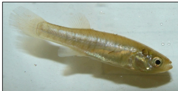
Figure 1: A mummichog. This species of fish may be the opposite of canaries in a coalmine. They are so hardy, that they can survive extreme changes in salinity, temperature, and water level.

Salt marshes are important habitats that contain a large diversity of species. These ecosystems flood with salt water during the ocean's high tide and then drain as the tide goes out. Fresh water also flows into marshes from rivers and streams. Many species in the salt marsh can be affected when the movement of salt and fresh water is blocked by human activity, for example by the construction of roads. These restrictions to water movement, called tidal restrictions , can have many negative effects on salt marshes, such as changing the amount of salt in the marsh waters, or blocking fish from accessing different areas.