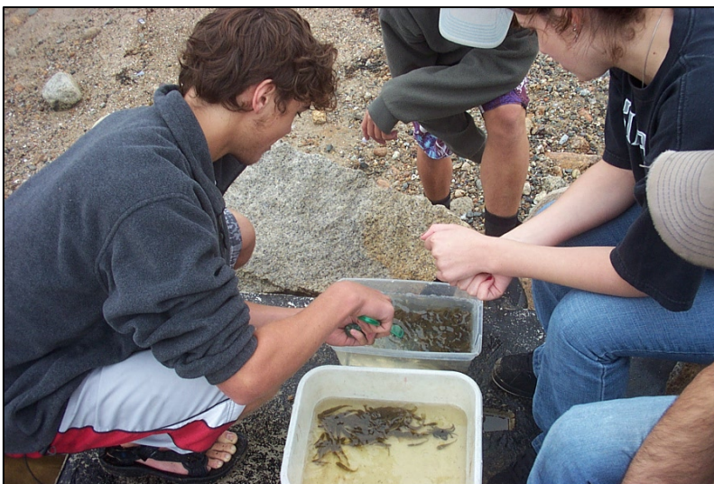
Figure 3: Students participating in Mass Audubon's Salt Marsh Science Project Count fish at Eastern Point Wildlife Sanctuary, Gloucester, MA

In December 2003, a channel was dug below the road to remove the tidal restriction and restore the marsh. From 2004 to 2007, students in the program continued to place traps in the same upstream location and collect data in the same way each year. They then compared the number of fish from before the restoration to the numbers found after the restriction was removed. The students thought that once the tidal restriction was removed, mummichogs would return to the upstream locations in the marsh.