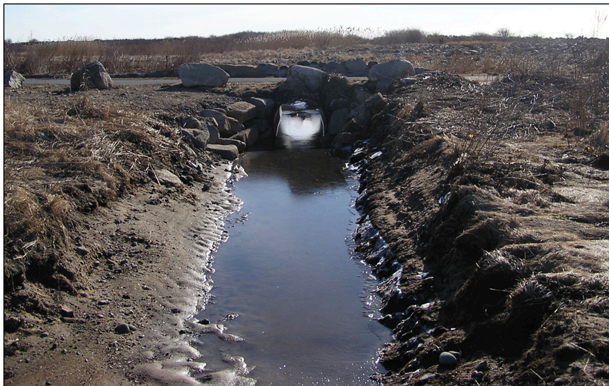
Figure 4: In December 2003, scientists dug a channel, which provided fish passage to a culvert under the road. The restoration brought back water flow between upstream and downstream of the tidal restriction.

Scientific Question: What effect did the removal of tidal restrictions have on the number of mummichogs found upstream?