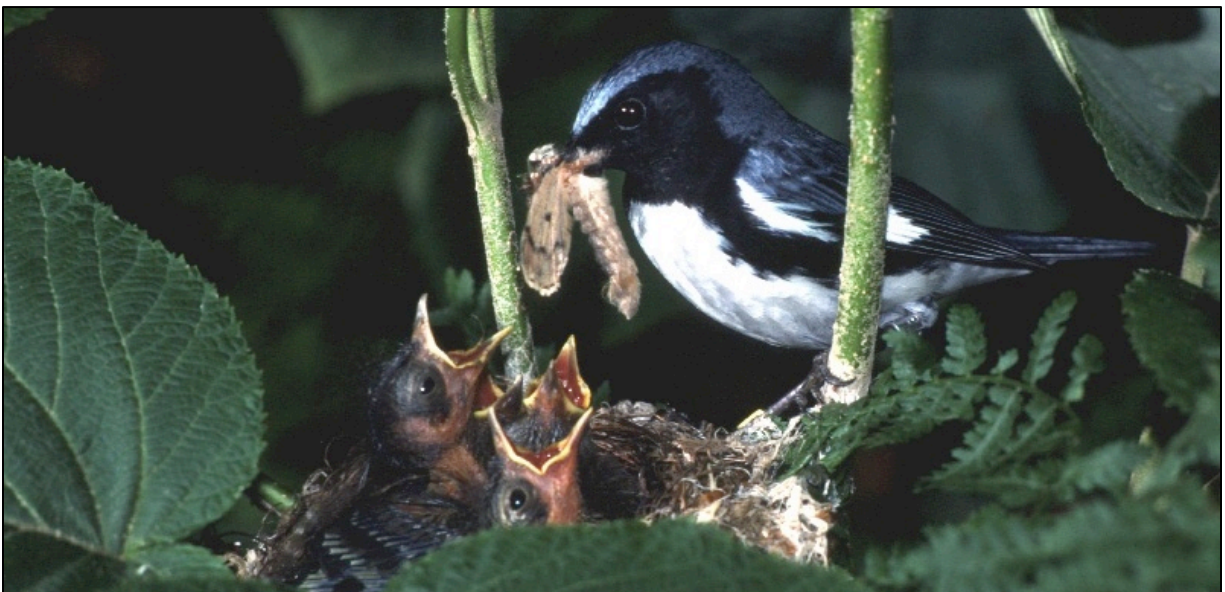
Male Black-throated Blue Warbler feeding nestlings. Nests of this species are built typically less than one meter above ground in a shrub such as hobblebush.