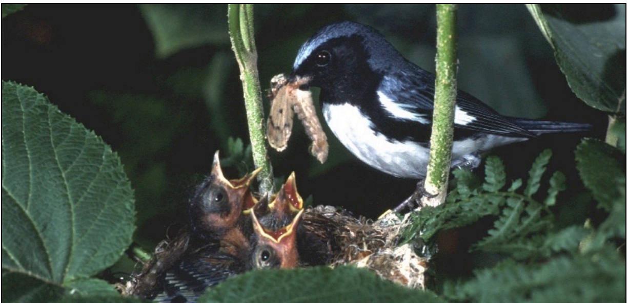
Male Black-throated Blue Warbler feeding nestlings. Nests of this species are built typically less than one meter above ground in a shrub such as hobblebush.