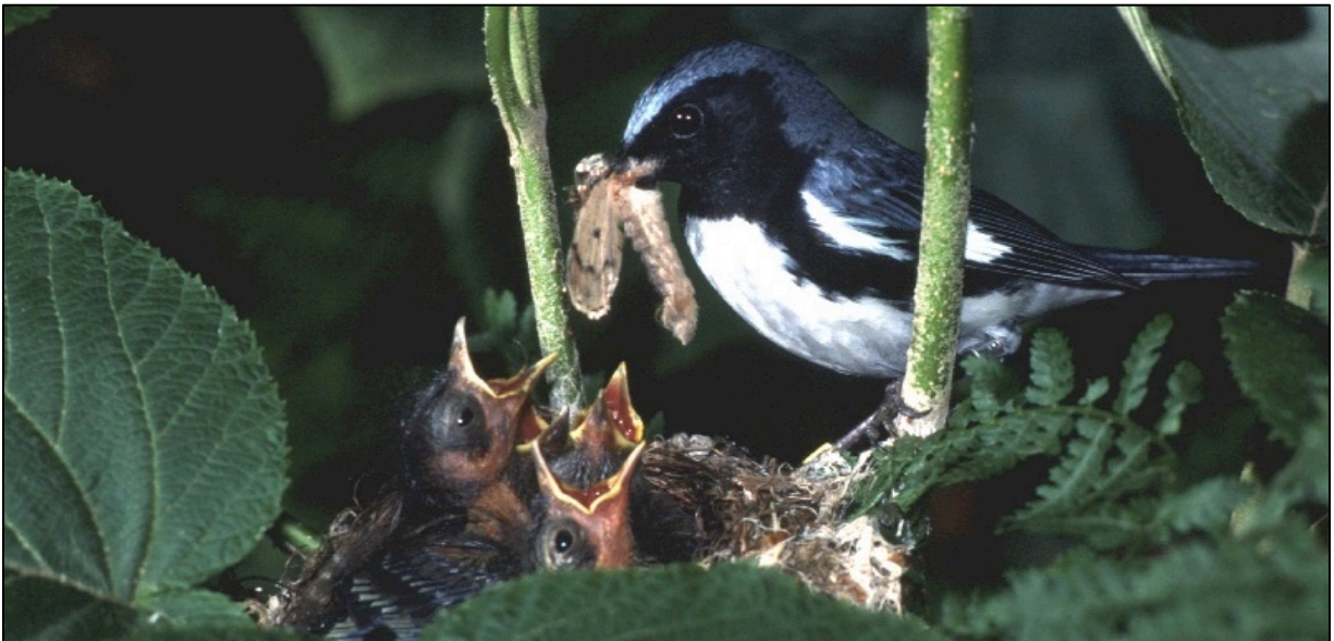
Male Black-throated Blue Warbler feeding nestlings. Nests of this species are built typically less than one meter above ground in a shrub such as hobblebush.