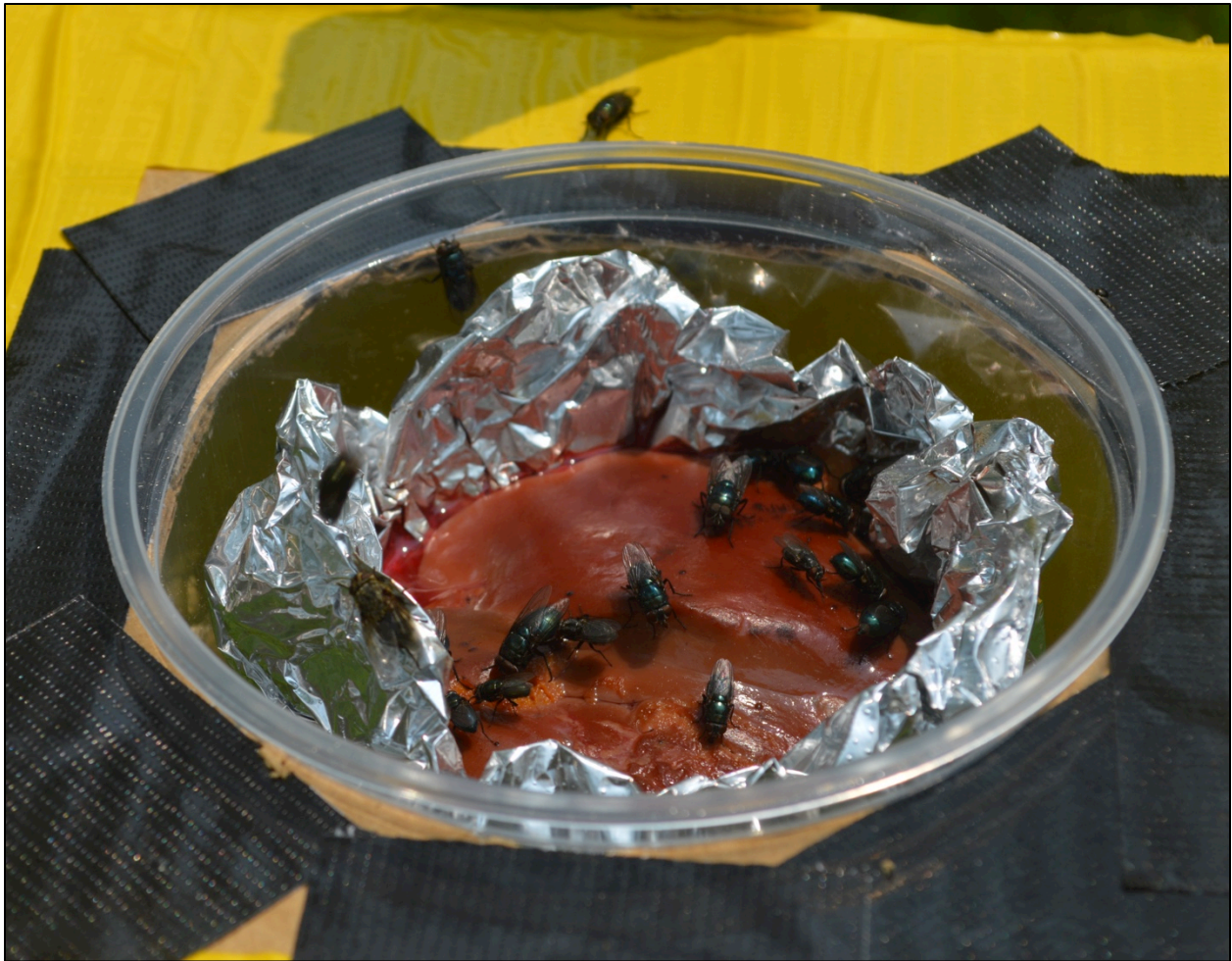
One of the 30 control bait cups with a large number of blow flies on the chicken liver

that contained chicken liver to simulate a dead human body. A total of 9 bait cups were used in each of the 10 trials, for a total of 90 cups. Of the 9 cups used in each trial, three contained only chicken liver, to represent a body with no wasps present. These cups were used as controls . Three cups contained chicken liver and a wasp pinned to the side of the bait cup so that there was a visual cue of the wasp. The final three cups had a crushed wasp sprinkled over chicken liver to see if blow flies could use a smell cue to tell that a wasp was present without seeing them. Researchers checked the cups every half hour for the presence of blow fly eggs. If they saw any eggs, they recorded the time of oviposition in hours after sunrise. They then brought the maggots to the lab and raised them to the third larval stage and identified them to species.