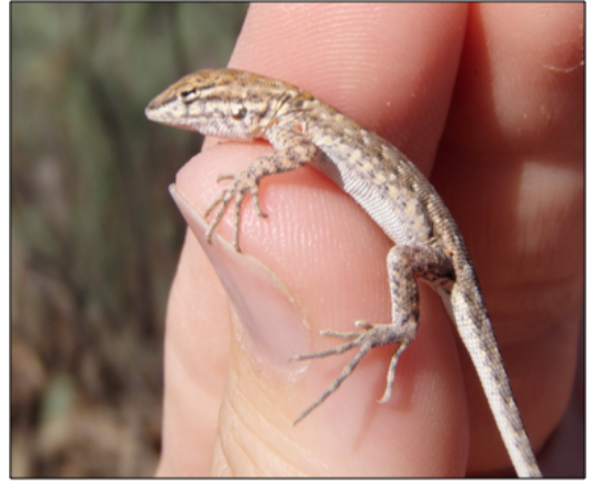
The Common Side-blotched Lizard