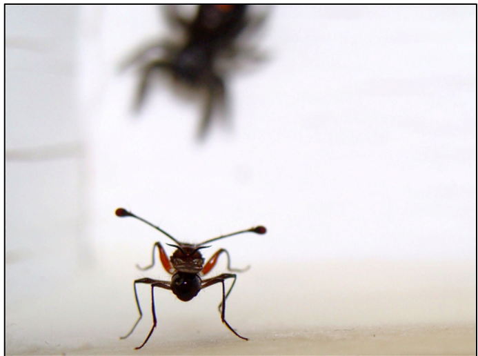
A stalk-eyed fly and spider interacting in the arena.

To test whether differences in eyestalk length and/or antipredator behavior were important for survival, male stalk-eyed flies were put in cages with predators. Amy and John filmed the fly behaviors and analyzed the footage. They calculated the frequency and proportion of time that flies were displaying antipredator behaviors. If males with longer eyestalks have lower