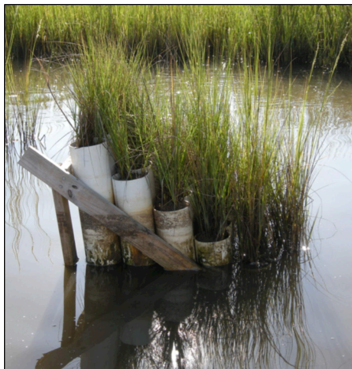
A picture of James' “marsh organ” which holds plants at different elevations relative to mean sea level. He gave it that name because it resembles organ pipes!