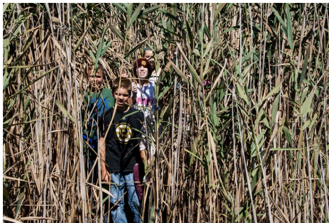
Students in Phragmites portion of marsh.

students collected data every meter. The transects made it possible to return to the same points in the marsh year after year. Along the transects, students counted the number of Phragmites plants and calculated abundance as the percent of points along the transect where they found Phragmites . They also measured the height of Phragmites as a way to figure out how well it was growing.