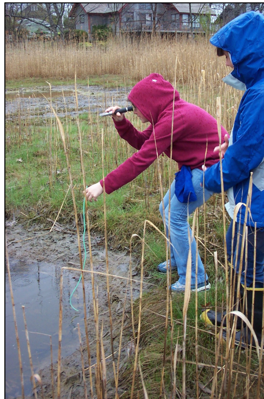
Students collecting salinity data at a point along the transect. The tall, tan grass is invasive Phragmites .

Salt marshes are wetland habitats near oceans where water-tolerant salt-loving plants grow. Usually native grasses dominate the marsh, but where humans cause disturbance Phragmites can start to take over. Human disturbance was having a huge effect on the health of Saratoga Creek by changing the water coming into the marsh. Storm drains, built to keep rain water off the roads, were adding more water to the marsh. This runoff , or freshwater and sediments from the surrounding land, made the marsh less salty. The extra sediment made the problem even worse because it raised soil levels along the road. Raised soil means less salty ocean comes into the marsh during high tide.