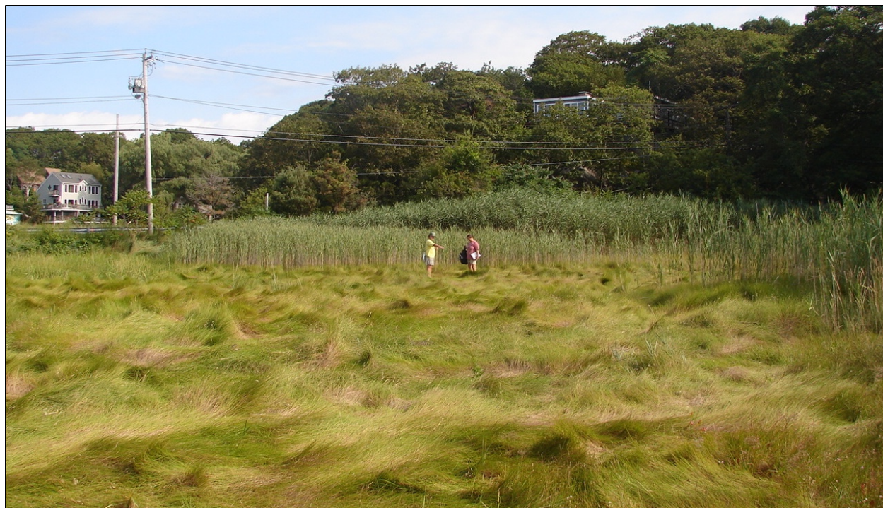
View of the Saratoga Creek salt marsh several years after restoration, showing location of one of the transects. Native grasses are growing in the foreground.

What is the hypothesis? Find the hypothesis in the Research Background and underline it. A hypothesis is a proposed explanation for an observation, which can then be tested with experimentation or other types of studies.