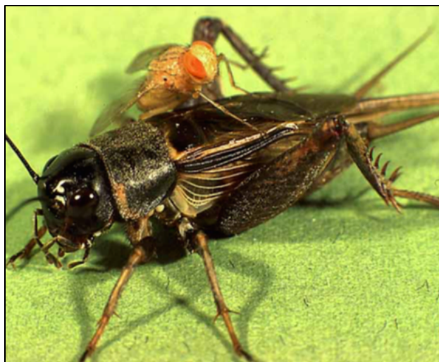
Figure 2: A parasitoid fly, Ormia ochracea , sitting on top of its cricket host, Teleogryllus oceanicus .

What is the hypothesis? Find the hypothesis in the text and underline it. A hypothesis is a proposed explanation for an observation, which can then be tested with experimentation or other types of studies.