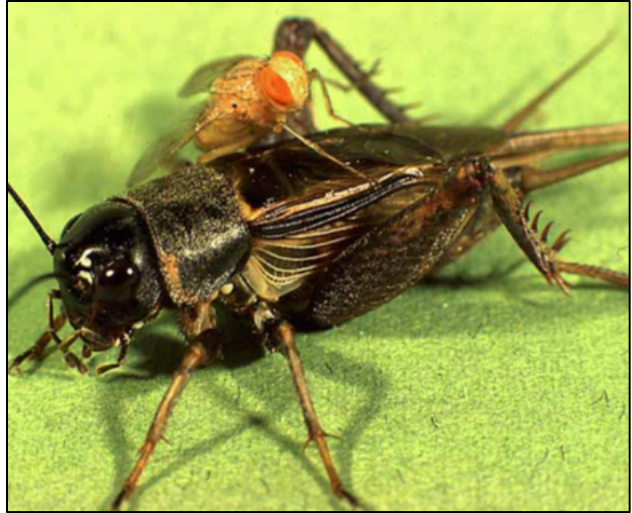
Figure 2: A parasitoid fly, Ormia ochracea , sitting on top of its cricket host, Teleogryllus oceanicus .

crickets remain unnoticed by the parasitoid flies. To test this idea, Robin dissected the males to look for fly larvae. She compared infection levels for 67 normal males—collected before the flatwing mutation appeared in the population—to 122 flatwing males that she collected after the flatwing mutation appeared. She expected fewer males to be infected by the parasitoid fly after the appearance of the flatwing mutation in the cricket population.