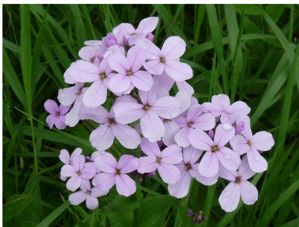
Dame's rocket growing in the field. This species of mustard was introduced to the US from Eurasia.

Scientific Question: How does temperature influence the phenology of dame's rocket?