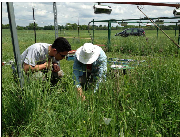
Scientists collecting phenology data in the climate change experiment. They are recording the date that the first flowers emerge for dame's rocket ( Hesperis matronalis ).