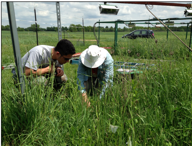
Scientists collecting data in the climate change experiment. They are recording the date that dame's rocket, a leafy plant, makes its first flower of the year.

Plants are very important for almost all life found on Earth. They make the oxygen that we breathe and are food for people and animals. Because plants are so important, we need to find out how climate change will affect them. How will higher temperatures affect the Earth's plants? One good place to start is by looking at flowering plants. Many flowering plants produce their flowers when the weather gets warm in spring, and the date that flowers first come out may depend directly on what the spring temperatures are like. It is possible that warmer and earlier springs generated by climate change cause flowers to bloom earlier and earlier. If flowers start blooming earlier each year, this could cause problems for pollinators (like bees and butterflies). They count on plants flowering around the same date each year.