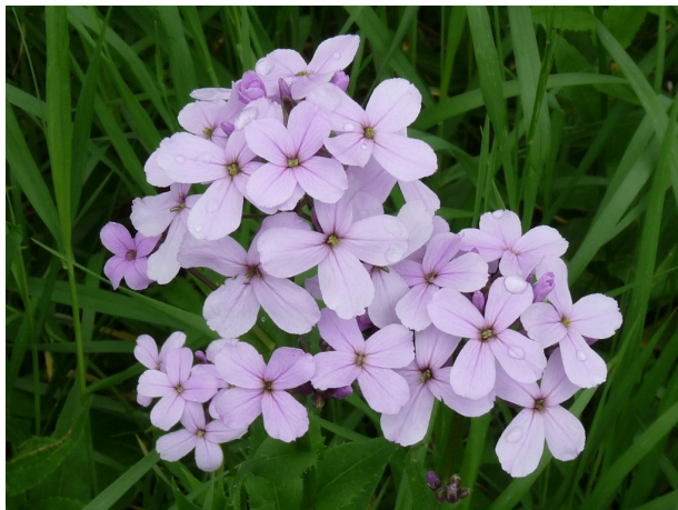
Dame's rocket growing in the field. This species of mustard was introduced to the U.S. from Europe and Asia.

Scientific Question: How does temperature affect the flowering time of dame's rocket?