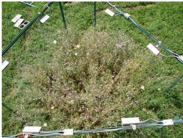
One of the heated plots shown from above. The silver boxes are electric heaters that raised the temperature inside the ring.