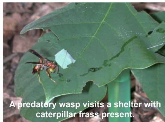
A predatory wasp visits a shelter with caterpillar frass present.