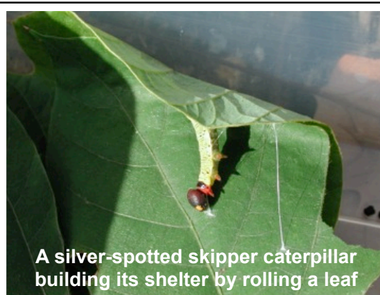
A silver-spotted skipper caterpillar building its shelter by rolling a leaf

Martha is a behavioral biologist who studies these insects. While raising silver-spotted skipper caterpillars in the lab, Martha noticed that they were making a pinging noise in their containers. Upon further observation, she discovered that they “shoot their poop”, sometimes launching their frass over 1.5m! Martha wanted to figure out why these caterpillars might have this very strange