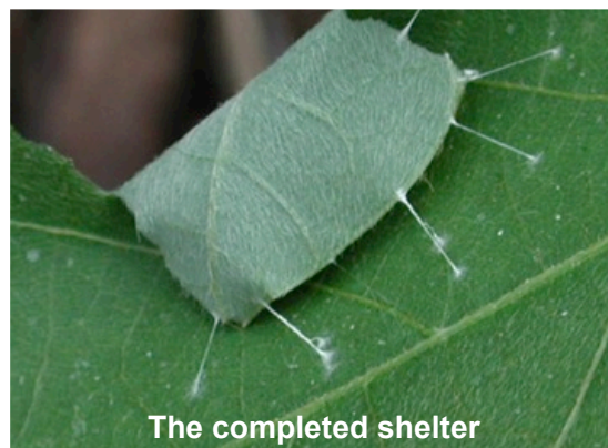
The completed shelter