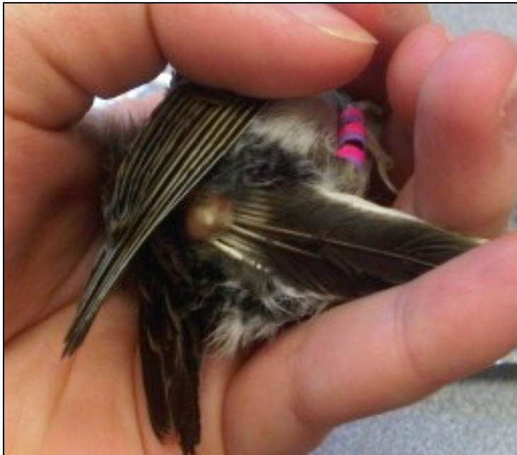
A preen gland where dark-eyed juncos produce preen oil.

What is the hypothesis? Find the two hypotheses in the Research Background and underline them. A hypothesis is a proposed explanation for an observation, which can then be tested with experimentation or other types of studies. Having two alternative hypotheses means that more than one mechanism may explain a given observation. Experimentation can determine if one, both, or neither hypotheses are supported.