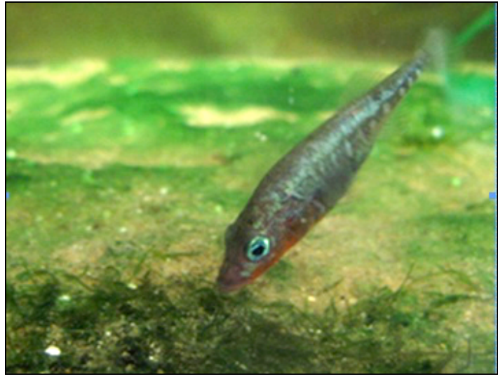
Figure 1: A male stickleback tending his nest. Notice the male’s bright red throat, blue eye, and blue-green body.

Alycia is a scientist who is interested in the stickleback’s mating behaviors. She wanted to figure out why there are differences between males and why certain males can attract a mate while others cannot. What is it about the way a male looks, moves, or smells that attracts females? What male traits are females looking at when deciding on a mate? Alycia thought female sticklebacks may choose males with redder throats and/or more complex behaviors because those traits show the female that those males are high quality. Previous work with these fish showed that male behavior, color, or territory size, or the presence of a nest could all be important. But it was still not clear which characteristic might be most important.