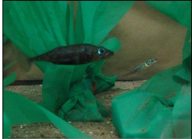
A male stickleback in his territory ( front ) and an intruding male ( back )

Stickleback fish use the shallow bottom areas of lakes to mate. Male stickleback fish fight each other to gain the best territories in this habitat. In their territories, males build a nest out of sand, aquatic plants, and glue they produce from their kidneys. The better the nest, the more females a male can attract. Males then use courtship dances to attract females to their nests. If a female likes a male, she will deposit her eggs in his nest. Then the male will care for those eggs and protect the offspring that hatch.