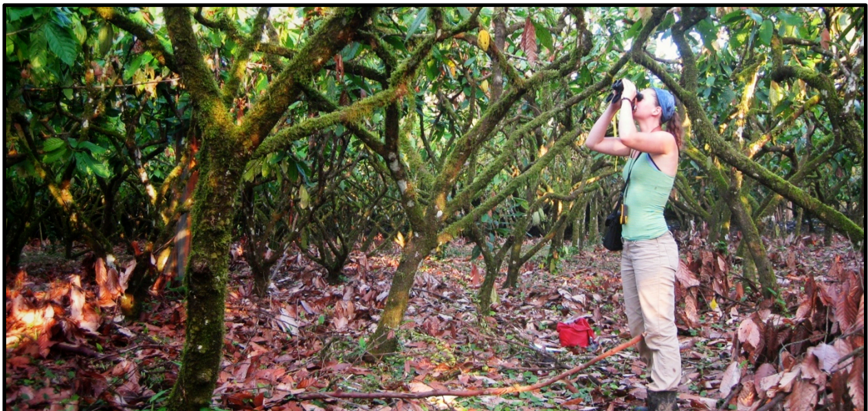
Skye out in the field counting birds along one of her four transects.

However, some agriculture might help some animals because they can use the crops being grown for the food and shelter they need to survive. One example is the cacao tree, which grows in the rainforests of South America. Humans use the seeds of this plant to make chocolate, so it is a very important crop! Cacao trees need very little light. They grow best in a unique habitat called the forest understory, which is composed of the shorter trees and bushes under the large trees found in rainforests. To get a lot of cacao seeds for chocolate, farmers need to have large rainforest trees above their cacao trees for shade. In many ways, cacao farms resemble a native rainforest. Many native plant species grow there and there are still taller tree species. However, these farms are different in important ways from a native rainforest. For example, there are