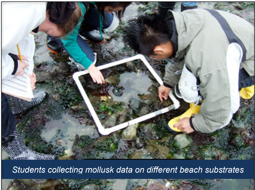
Students collecting mollusk data on different beach substrates

Mollusks have a "foot" which may be able to attach more securely to larger substrates, such as boulders, and allow them more room to move. So, the students expected to find more mollusks on boulders than on other types of substrates. To gather the data needed to answer this question, the students went to a