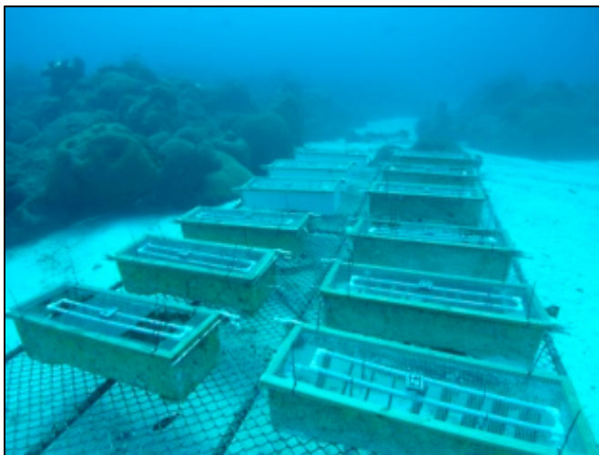
Experimental setup with tiles in bins. Some bins have sea urchins and some do not.

Sarah set up an experiment where she put tiles in bins out on the reef. Tiles provided space for animals to grow, including corals. Sarah also put sea urchins in half of the