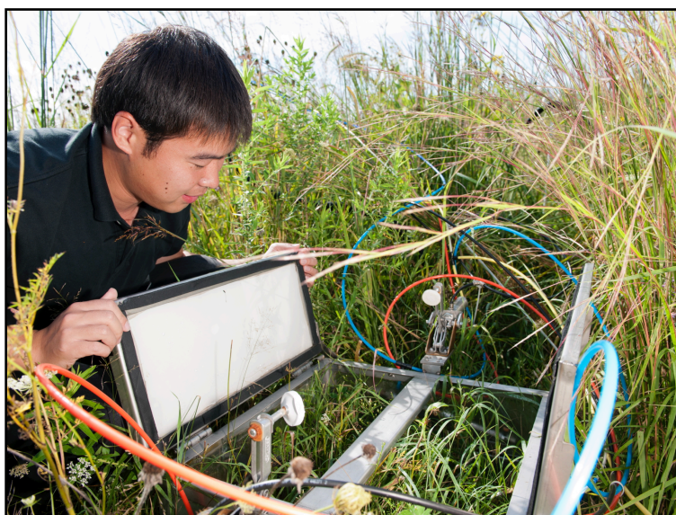
Scientist Leilei collecting samples of gases released by the growing of biofuel crops.

One potential solution could be to grow our fuel instead of drilling for it. Biofuels are a potential substitute for fossil fuels. Biofuels, like fossil fuels, are made from the tissues