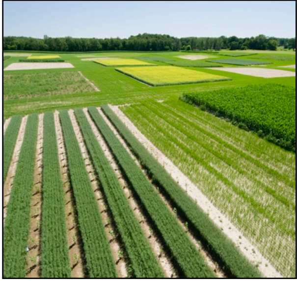
An aerial view of the experiment at MSU where biofuel crops are grown.