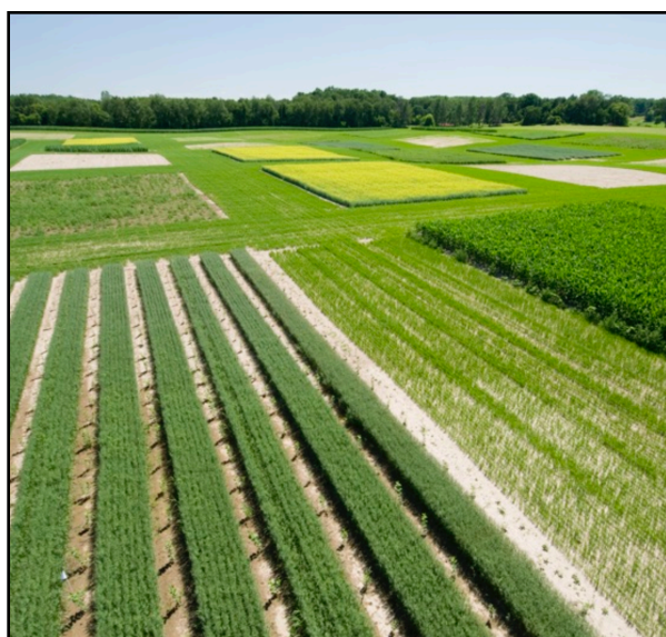
An aerial view of the experiment at MSU where biofuel crops are grown.