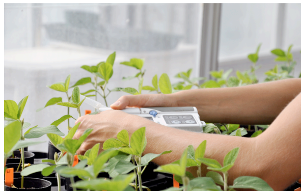
Measuring chlorophyll content in the greenhouse.

Scientists expected Rhizobia from organic soil to be more cooperative and cause soybeans to grow bigger than Rhizobia from low N or high N soil.