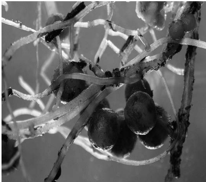
Figure 1. Nodules on legume roots. Rhizobia grow inside the nodules and convert atmospheric nitrogen ( N_2 ) to ammonium ( NH_3 ).

produced through photosynthesis. With the rhizobium–legume system, students can address and readily connect multiple big ideas with their questions and investigations while developing their science practice skills.